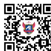
Word bank & video

**From this year onwards, the admission ticket will no longer be sent by SMS or mail, but will be downloaded online instead, please pay attention!**