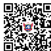
Admission ticket download

The admission ticket will be available at noon on 25 th April to 2 nd May 2025, you can download it from the association website by yourself.